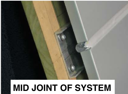
MID JOINT OF SYSTEM