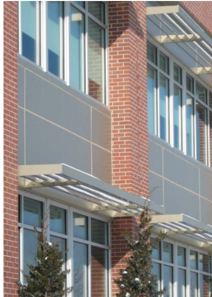
Lamar Office Centre, Leawood, KS Slaggie, Architects, Inc.