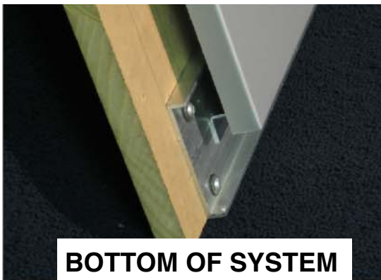
BOTTOM OF SYSTEM