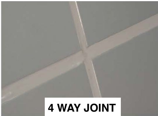
4 WAY JOINT